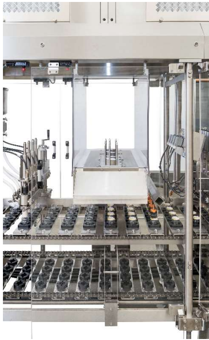
Pict 2: Lowered chassis for storage stations within arm's reach

Available for stackable and non-stackable cups, the LINEA XS can also be combined with a cup blower in the CUPBOX block variant.